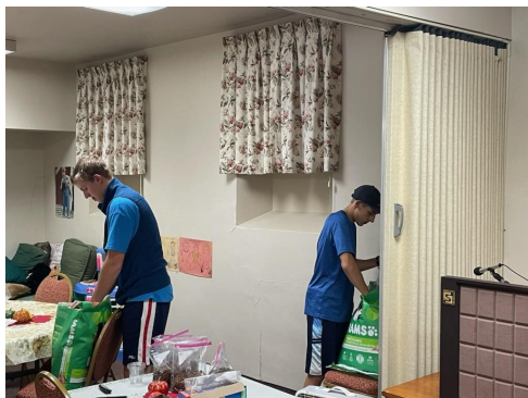
High School Logos lending a "Helping Hand" at First English Lutheran Church.