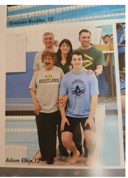
The Elkin Family The only family I know who can make it into the CMR Yearbook!