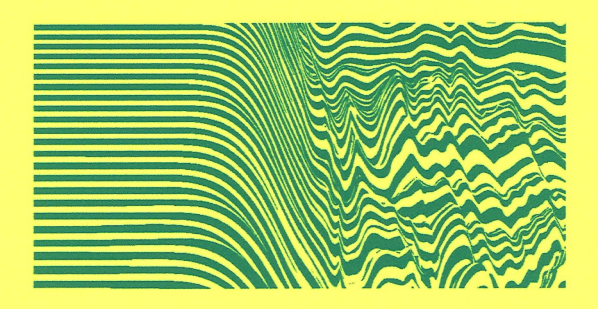
New Music ≈ Great Falls