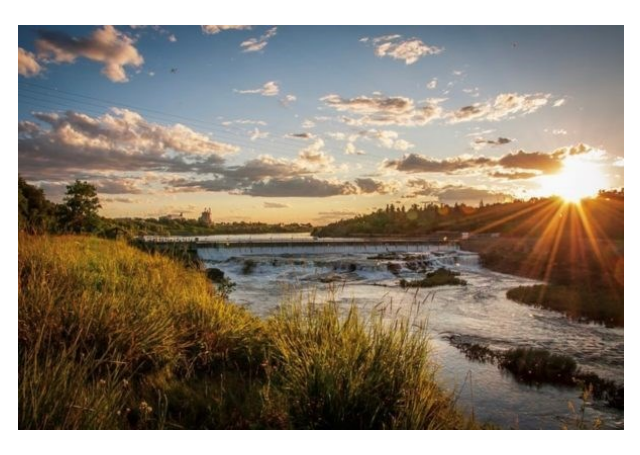
View of Black Eagle Falls from River's Edge Trail

One doesn't even have to leave the oity to find God's beauty all around!