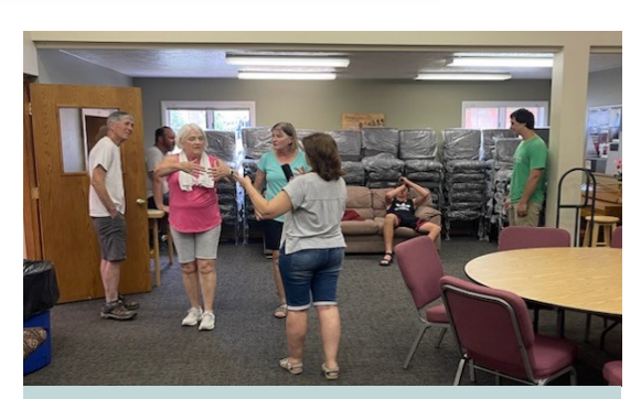
Sharing stories after the work is done.