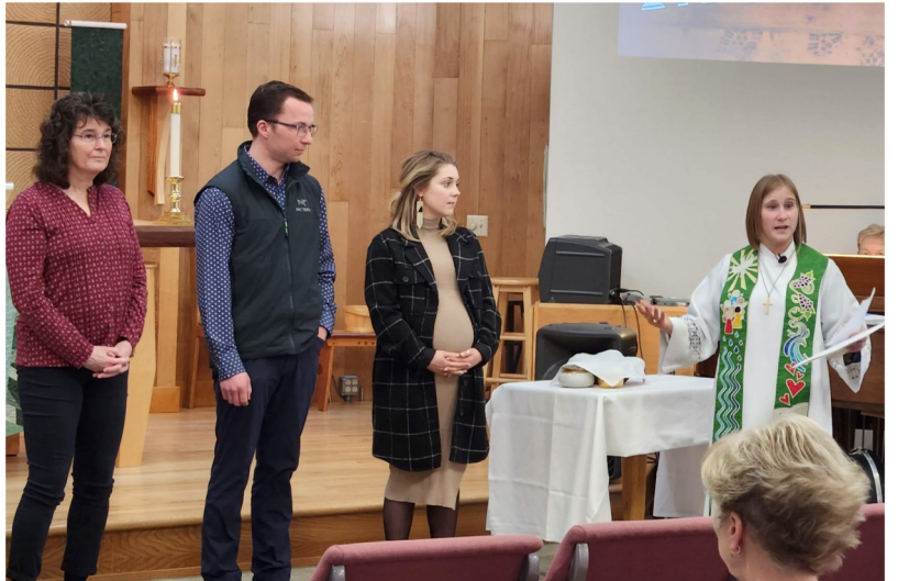
New members welcomed to Bethel last Sunday.