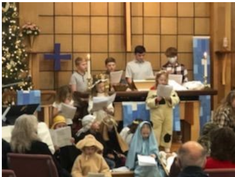
Nativity Choir sings familiar Christmas Hymns.

Thank you to all of our Logos Youth, Families and Bethel Members and Guests for making this year's Christmas Program so very special.