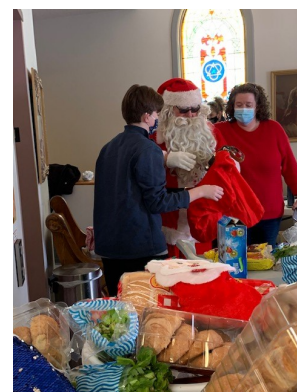
Santa even stopped by to put helpers on his Nice List!