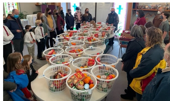
Saying a prayer for all who donated and helped with the food baskets.