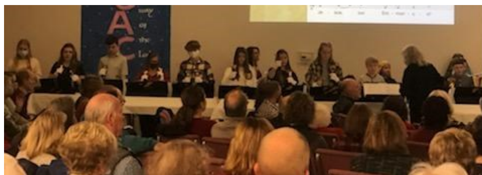
Youth Bell Choir played Hark! The Hearal Angels Sing and We Wish You a Merry Christmas!