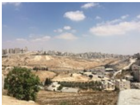
Shuafat Refugee Camp

By now, I'm sure you've noticed that I am on a Christian mission, a word with so much historical baggage that I tend to shy away from it in conversation. In the context of the Americas, missions were part and parcel of the colonial project of subjugating Native Americans and settling the West. I'm happy to say that the ELCA's model of mission is based on accompaniment, which is a fancy way to say walking alongside our partners, rather than in front of them. Not my God vs. your God, but rather where God is in our shared story. Who are our partners? The Palestinian men and women of the Evangelical Lutheran Church in Jordan and the Holy Land ( ELCJHL ).