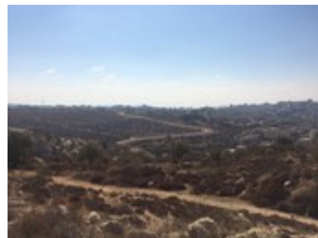
Beit Jala and the Wall/Fence

A popular snack in Palestine. Like Cheetos Puffs but a peanut butter flavor.