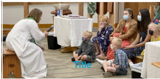
A wonderful Children's Message.