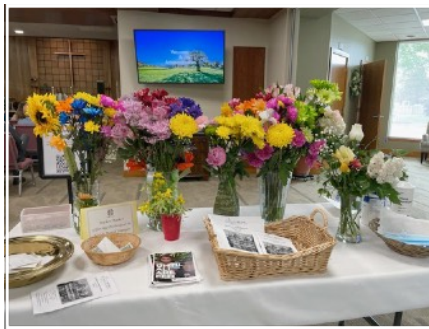
We showered her with flowers!