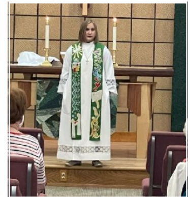
An excellent sermon.