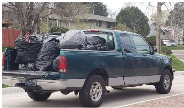
The results of lots of helping hands.