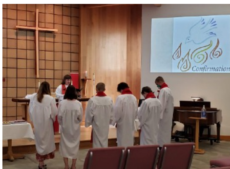
GROUP PRAYING DURING SERVICE