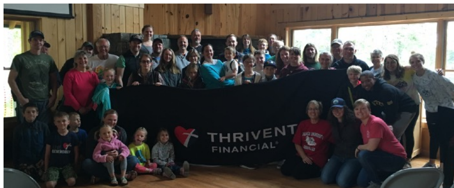
FIRST YEAR WE WENT AS A FAMILY AND THE GREAT PEOPLE WE MET!

Come have a fun weekend and help FLBC get ready for summer!