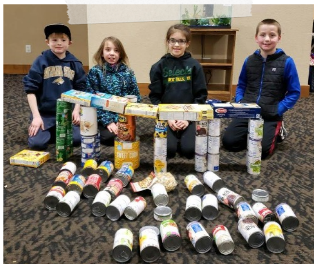
3rd & 4th Grade got most technically difficult for their bridge!