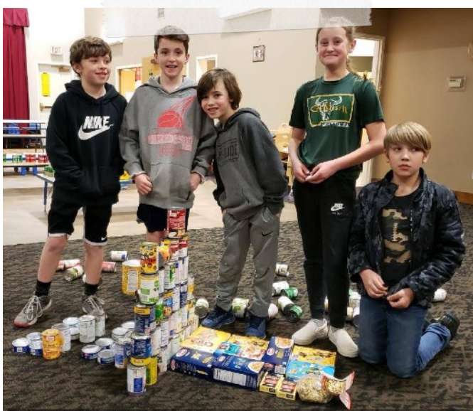
5th Grade got most creative for their mountain and river!