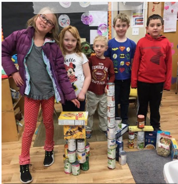
1st & 2nd Graders!

Our Logos CANstruction brought in 160 pounds of food for FISH! and creativity with our landscape theme.