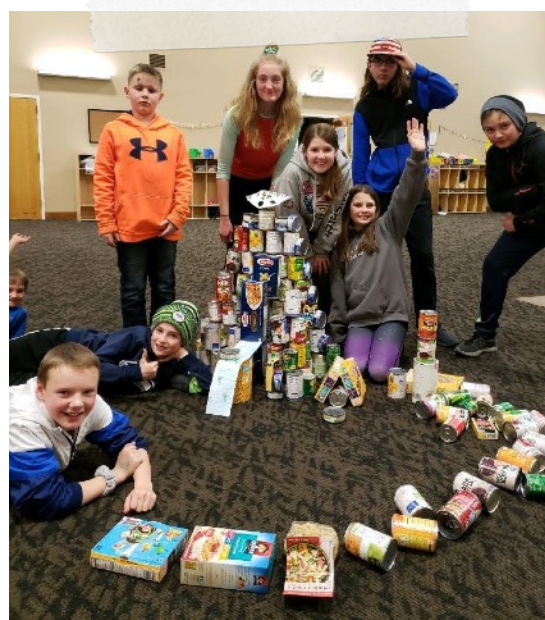
6th Grade got best over all for their waterfall and river!