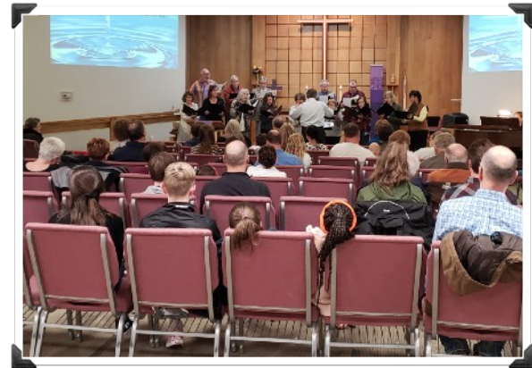
The Jubilate Choir performed Cleanse Me.