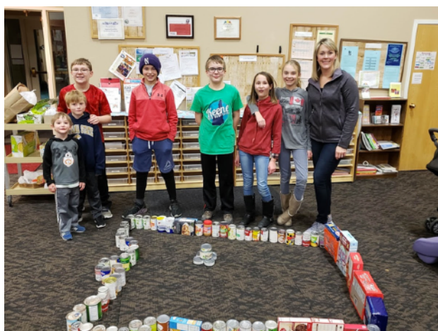
6th Grade made the state of Montana and highlighted Great Falls.

THEY HAD A LOT OF FUN AND ALL FOOD DONATED GOES TO THE FISH PROGRAM. THANKS TO ALL THOSE WHO DONATED AND PARTICIPATED.