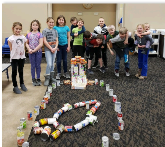
3rd & 4th Grade made a water feature with a fish swimming in the river.