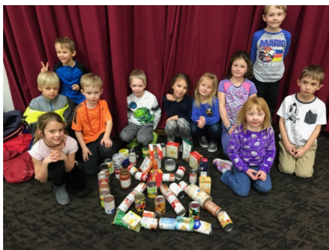
Kinder, 1st & 2nd theme was a little different. They made Angel in the Snow.