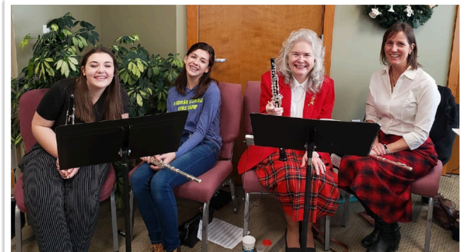
Winds Quartet also provided special music on Sunday