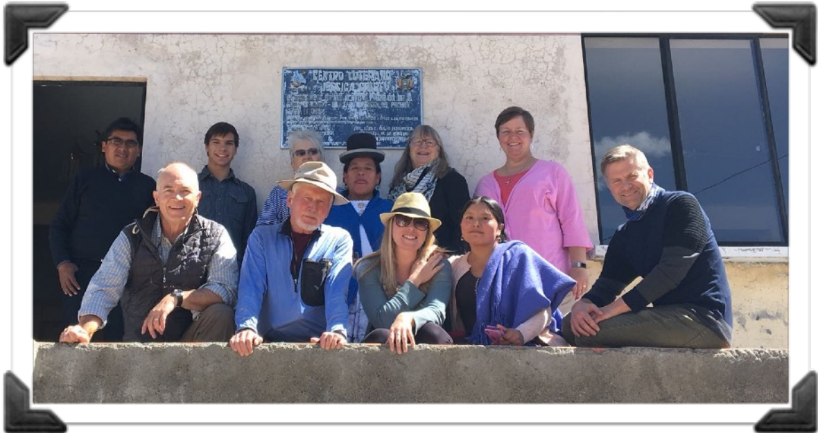
At the Jessica Crist Retreat Center near Lake Titicaca.