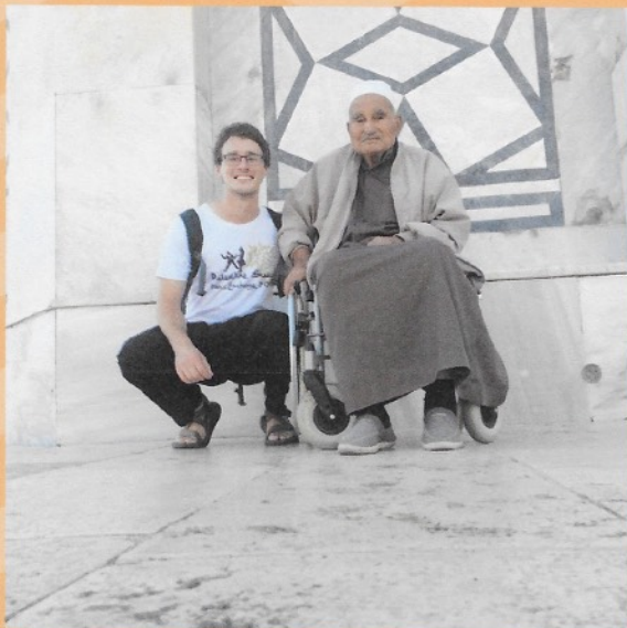
A man from Gaza being treated in Jerusalem visiting Al-Aqsa Mosque for the Day