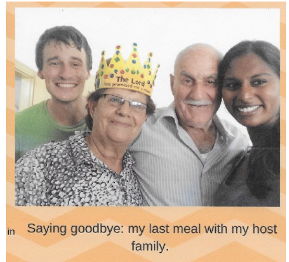
in Saying goodbye: my last meal with my host family.